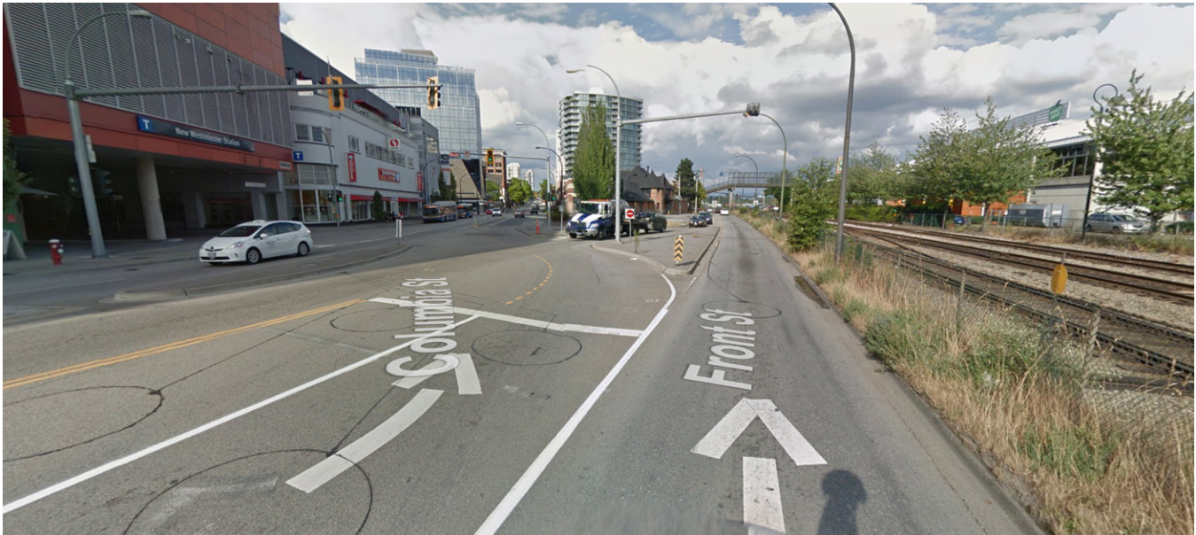
Looking northeast on Columbia Street and Front Street.